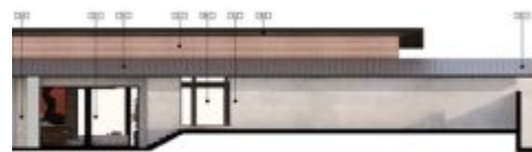
SOUTH ELEVATION 1/8" = 1'-0"